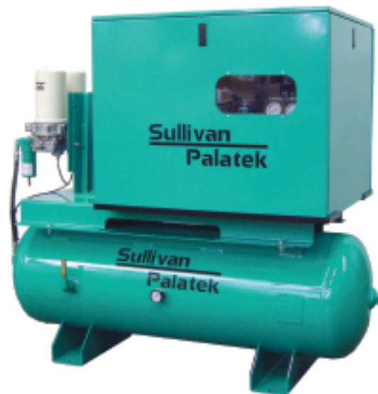
OPTIONAL CDDE MODEL SHOWN